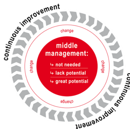
Figure 1: Three views of middle management

These reflections can be captured in three different views on middle management (see Figure 1), which we will elaborate on hereafter. One view is that middle managers are no longer needed, due to changing ways of working in organizations, increased automation of various work processes and higher levels of employee independence and autonomy (Balogun 2003; Cameron et al. 1991; Gratton 2011; Hamel 2011). Another view on the role of middle managers is that they have insufficient potential. If top management adopts this viewpoint, middle managers can become demotivated because they do not feel heard and because they face many organizational changes (Zenger and Folkman 2014). A third view is that middle managers have great potential, because they occupy a unique position in the organization (Lawrence and Lorsch 1967; Mintzberg 1989; Tinline and Cooper 2016) and can ensure the connection between the shop floor and top management as well as translate the ideas from the top to operational activities (Nonaka 1994).